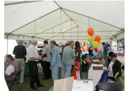
At Celebration Métis 2004