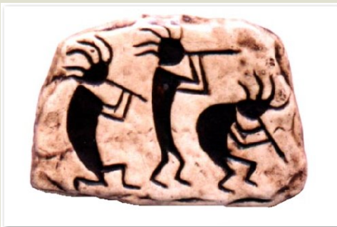
Kokopelli—the Ancient bearer of seeds and God of Agriculture. May his spirit be with us as Walk Bravely Forward contin- ues to grow.

This coming year we are concentrating on expanding our programs, and have been building partnerships with other communities and community organizations in our quest to build ever-expanding resources for offenders. Lately, our partnership building has deepened to the point where we seem to be generating a lot of interest in what we are doing. And, it seems, a lot of community groups are coming on-board.